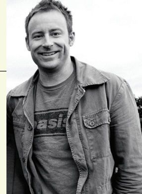
By Kevin Raub

High-maintenance hair sends our reporter on a very specific search