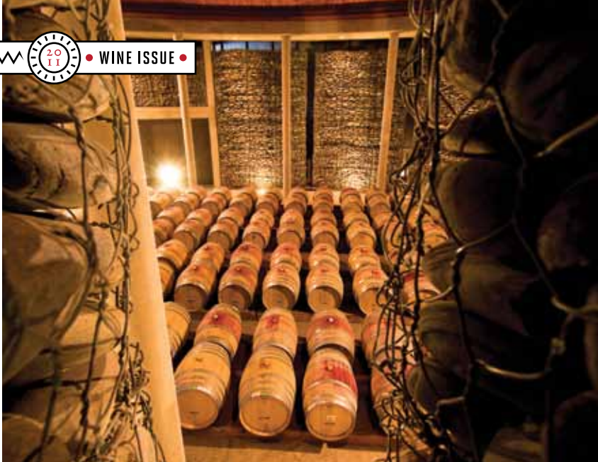
Barrels at Matetic; (below) La Casona, the vineyard's sumptuous retreat

Emiliana Organic Vineyards ( www.emiliana.cl ; 56 2 353 9130). It was here that 2003's Gê vintage marked the release of South America's first-ever certified biodynamic wine. It's a