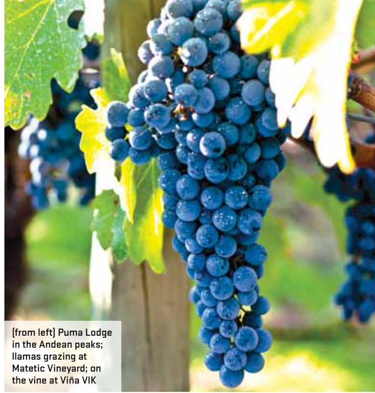
(from left) Puma Lodge in the Andean peaks; llamas grazing at Matetic Vineyard; on the vine at Viña VIK

You can begin your day dropping in on 11,000-foot powdered peaks, head down the mountain for a little wine tasting, and close your evening with a sundowner on the beach.